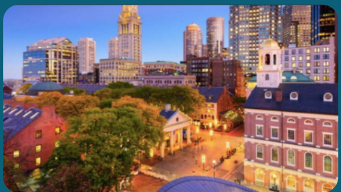
Fanueil Hall & Quincy Market